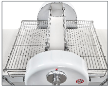
Movable Safety Guard